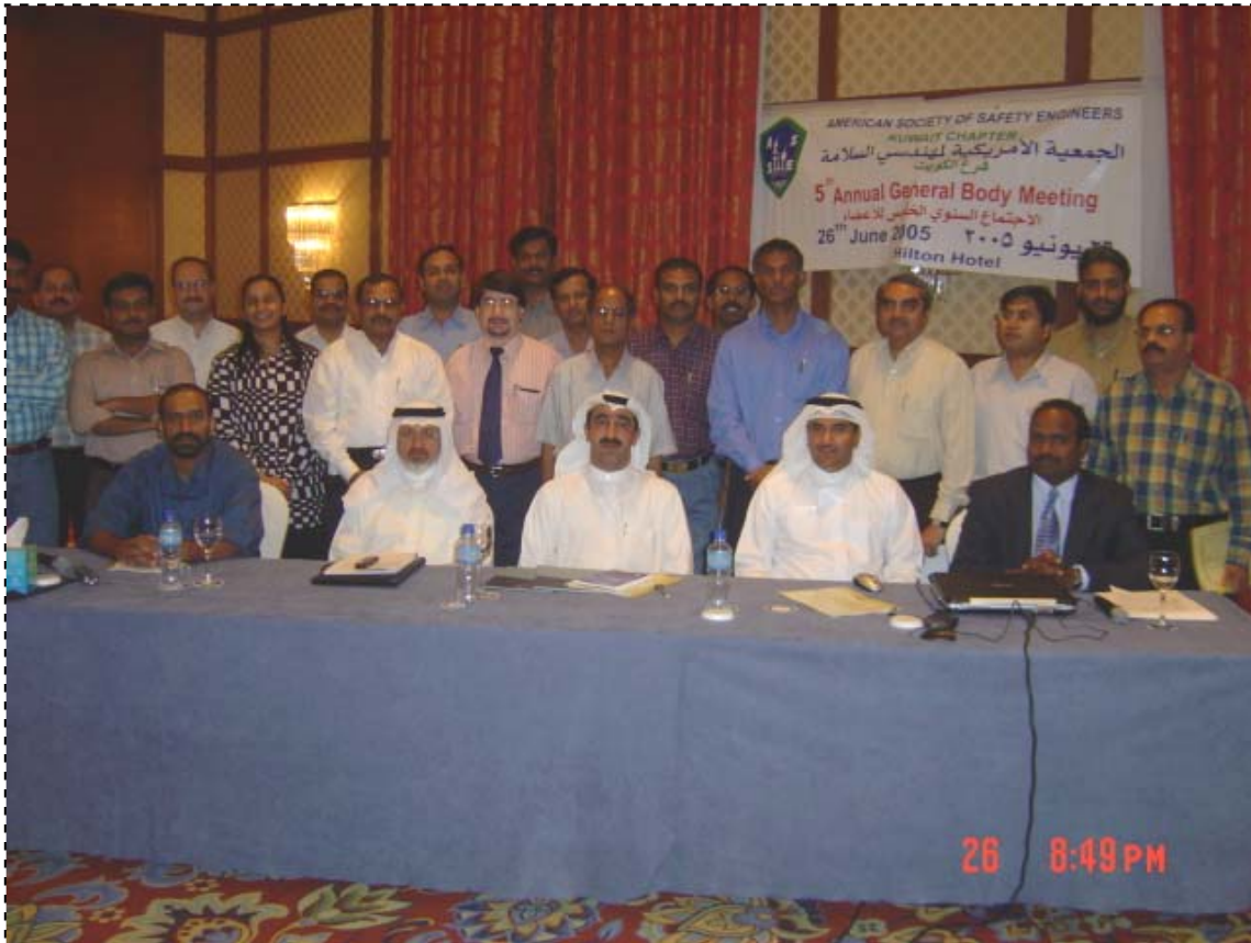
ASSE-KC NEW EXECUTIVE COMMITTEE MEMBERS (2005-2006) POSES A GROUP PHOTO